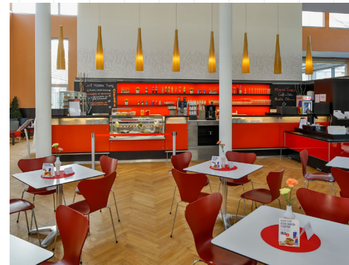
Café Modern Times Mall between Hall C & B