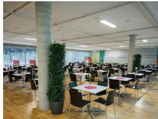
Panorama Restaurant Hall D | 1 st floor