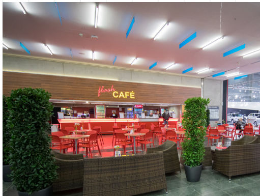
Café Flash Foyer D