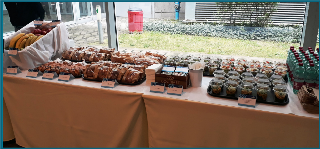
Create your own lunch bag