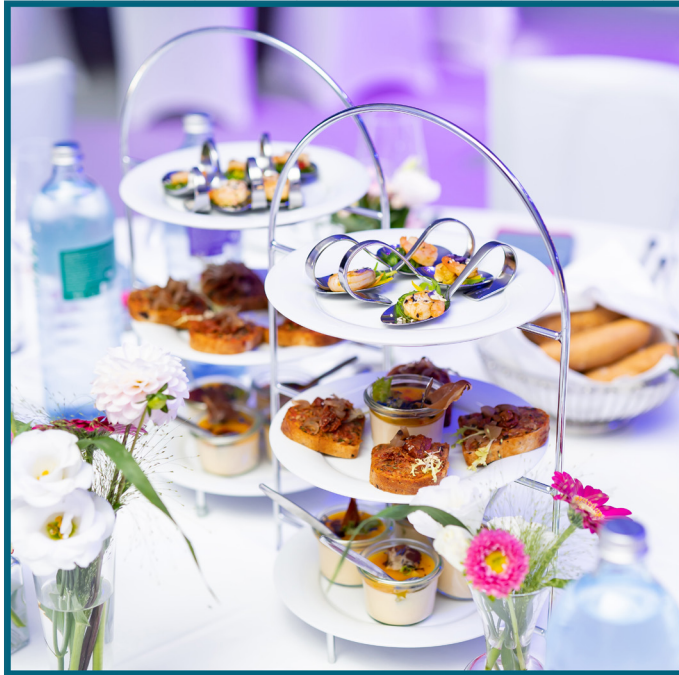
Image photo | starters